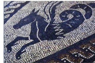
Sea-horse Fishbourne Roman Palace UK

Examples and designs of mosaics by children.