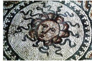
Medusa Bignor Villa UK